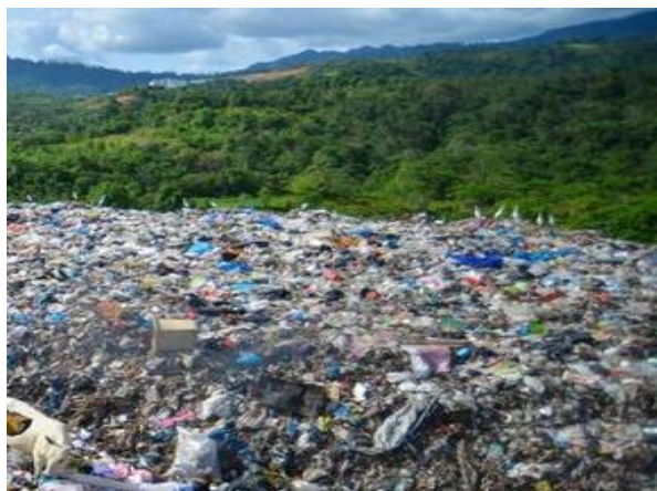
Figure 1. Current condition of the Air Dingin Landfill

At present, there are twelve semi-permanent houses occupied by twenty-eight residents located to the north and west of the landfill. To the east, there are pens for cattle and chickens, while to the south, across the street, stand several permanent homes along with a place of worship. Residents access clean water for their daily needs by filtering water from wells that are dug at each residence.