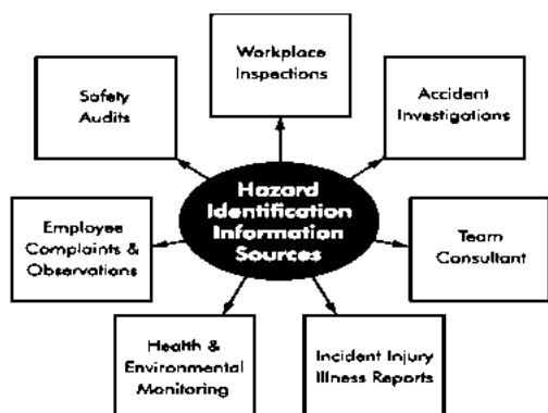
Figure 2. Hazard Identification Information Sources

Hazard identification is the process of identifying all hazards in the workplace. There is no set method for grouping agricultural injury and illness hazards (Kabul & Yafi, 2022). Hazard identification analysis in solid content practicum is carried out to determine the risks that may occur and prevent accidents or other negative impacts (Henri Prasetyo et al., 2018). The hazard identification in this study was carried out systematically through direct observation of the laboratory environment and referring to accurate data. Hazard identification is the first step in risk management, which forms the basis for accident prevention or risk control