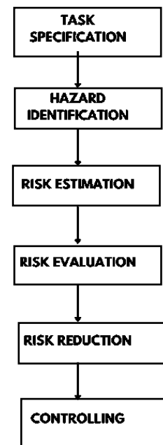
Figure 1. HIRAC Process Flowchart

ISO 45001 is an international standard that provides guidelines in occupational health and safety management systems. This standard was issued by the International Organization for Standardization (ISO) in 2018 and replaces the previous standard, OHSAS 18001. The ISO 45001:2018 clauses that are being highlighted in this study are Planning, Operation, Performance Evaluation, and Improvement. The planning is determining the risks of doing the experiment mentioned in this study, the operation is to handle and manage the risks that may happen, the performance evaluation is finding the problem that caused the risk and then monitoring, measuring, analyzing and evaluating the performance of the safety management system, and the improvement is identifying and correcting the past mistakes that leads to accident in the Solid Content Determination Experiment ( Iso 45001 2018 , 2018). Fig.1 depicts the methodological framework of this study.